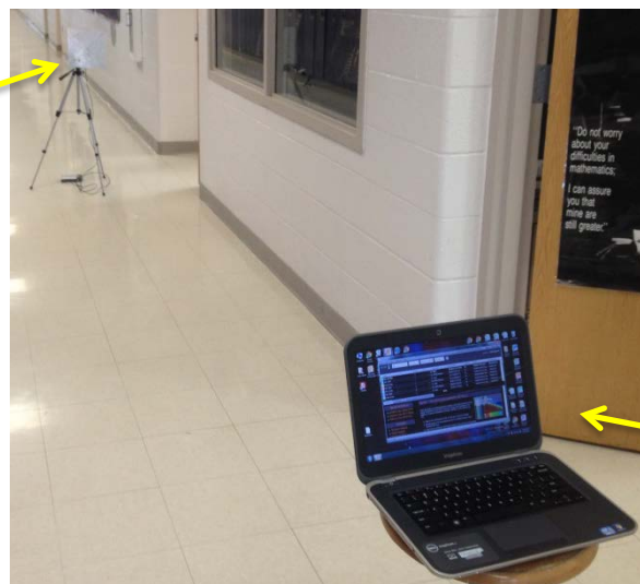
Receiving laptop with WiFi software.